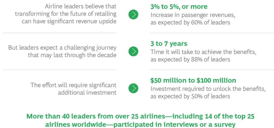
Exhibit 1 - Global Industry Leaders Expect a Resource-Intensive Transition—but One That Will Pay Off

Sources: BCG x IATA survey, 2022; BCG analysis.